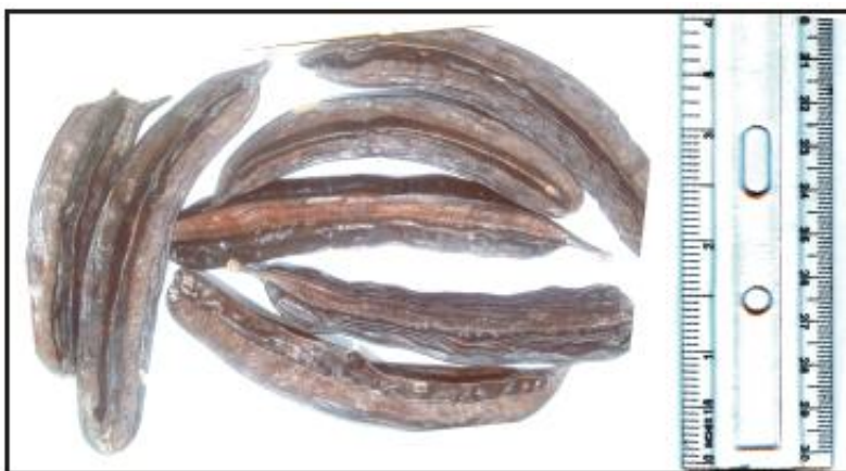
Plate1. Matured Fruits of Tetrapleura Tetrap Tera

Matured fruits of Tetrapleura tetraptera (Schum and Thonn) Taub were collected from the mother tree in Uyo Local Government Area, Akwa Ibom State. The seeds were removed from the pod by splitting the pod (Plates 1 and 2), wind-blown and sundried for 24 hours to enhance germination. A total of 1800 seeds with no visible sign of infection were selected from the lot and sown in germination boxes measuring 28 cm x 14 cm x 14 cm filled with washed and sterilized river sand to raise seedling for this study. Watering was done twice daily for effective germination.