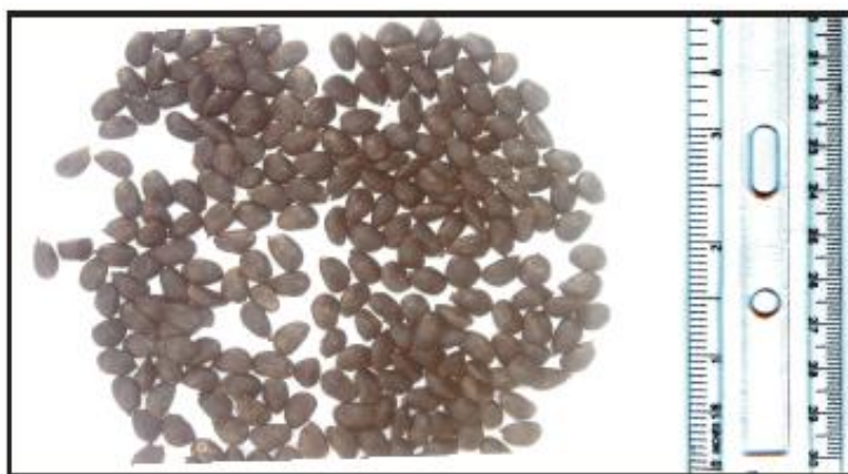
Plate2. Seeds of Tetrapleura Tetraptera

Growth Medium: Four different soil types were sampled and obtained from 0 – 15cm and from 15 – 30cm depths in 20 randomly selected points and analyzed. Specifically, the soil were Sandy loam (S L), Loamy sand (LS), Sandy clay loam (SCL) and Silty clay loam (SICL). Soil analysis was carried out on these soils to determine their description and nutrient status (Table 1)